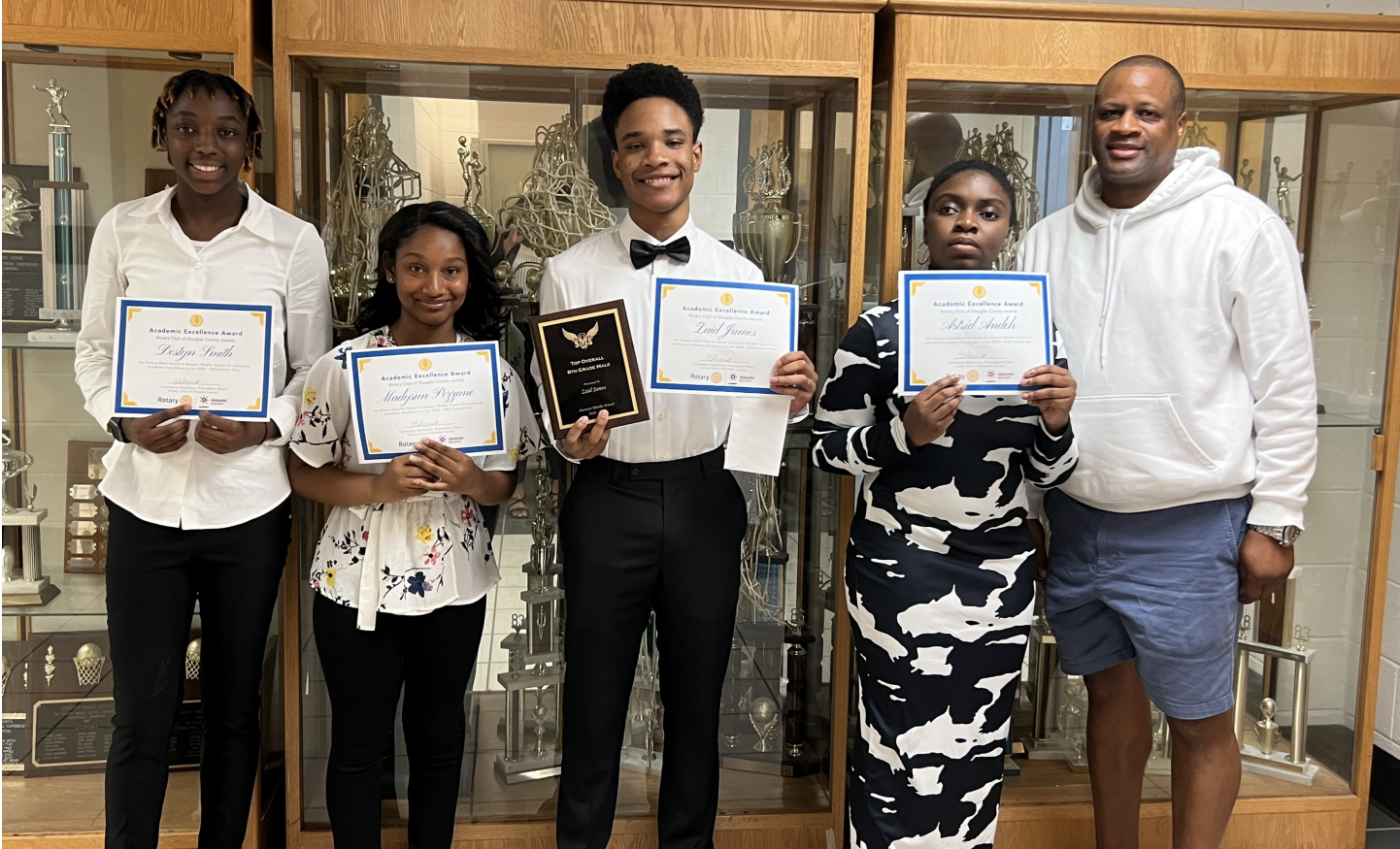
Posted by Nell Boggs