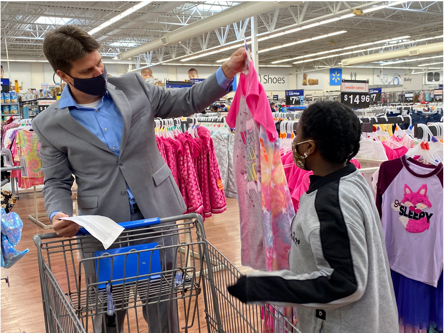
Posted by Samantha Rosado January 10, 2021