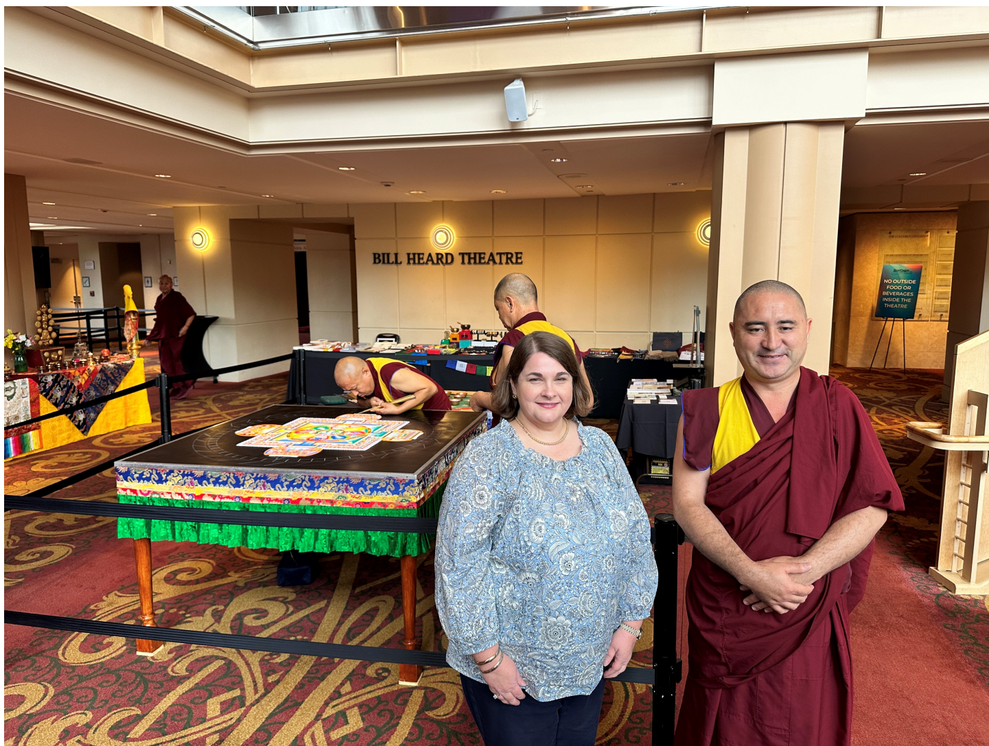
Posted by LeighAnn DiCesaris October 2, 2024