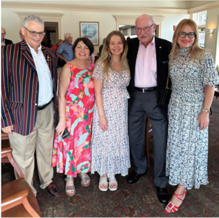
Posted by Julie Bond October 1, 2023